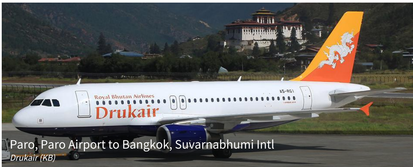
Paro, Paro Airport to Bangkok, Suvarnabhumi Intl Drukair (KB)